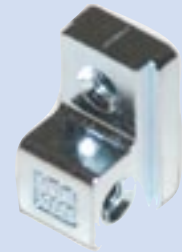
Card mounting bracket - metal