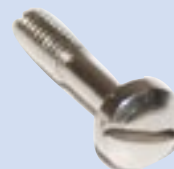
Fig .5 - Captive slotted screw