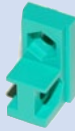
Card mounting bracket - plastic