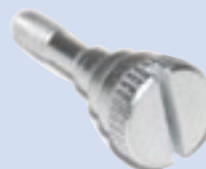
Fig .3 - Captive thumb screw