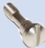
Fig .1 - Captive slotted screw