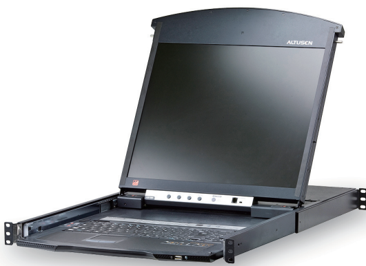
● KL1516Ai Front view