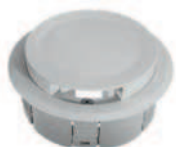
Illustration shows 930.099 and 930.137