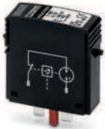
Surge protection plug type 2, with N-PE total current spark gap for base element.

Please be informed that the data shown in this PDF Document is generated from our Online Catalog. Please find the complete data in the user's documentation. Our General Terms of Use for Downloads are valid ( http://phoenixcontact.com/download )