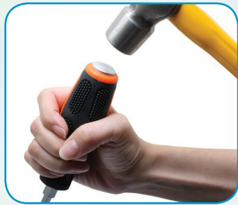
The steel cap withstand single hammer blow