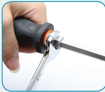
The hex shaft and bolster fit any brand of wrench which can loose tight screws easily.