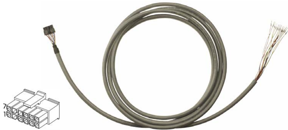
Figure 3-7 EPOS2 Signal Cable 2