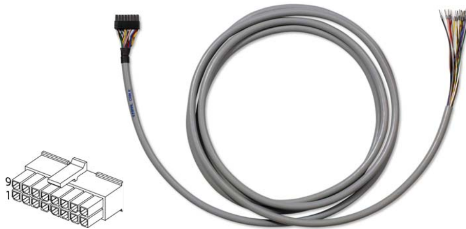
Figure 3-6 EPOS Signal Cable 1