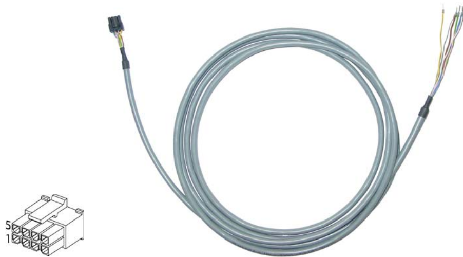
Figure 3-8 EPOS2 Signal Cable 3