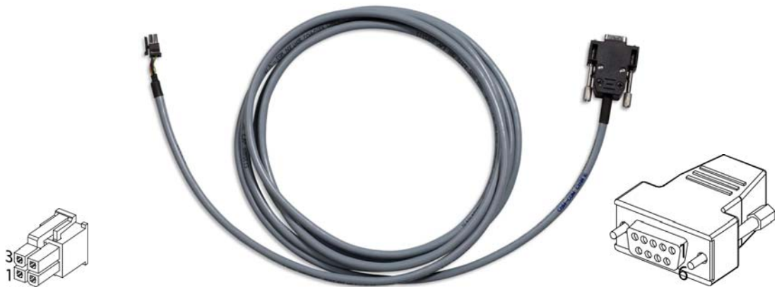
Figure 3-11 EPOS CAN-COM Cable