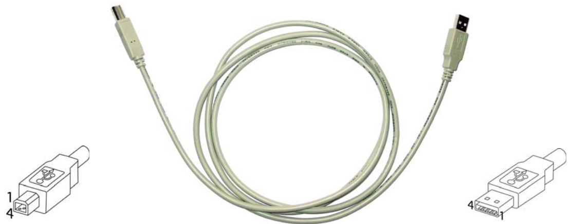
Figure 3-10 EPOS2 USB-COM Cable