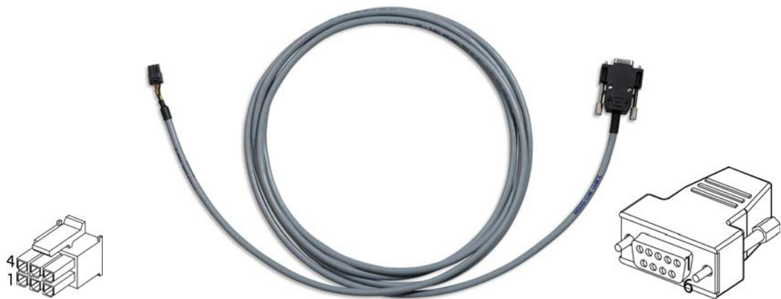
Figure 3-9 EPOS RS232-COM Cable