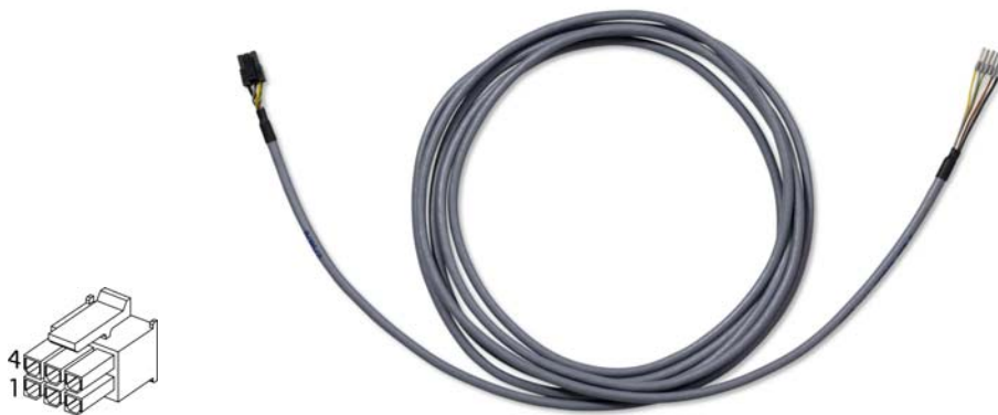
Figure 3-4 EPOS Hall Sensor Cable