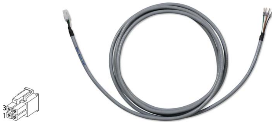
Figure 3-3 EPOS Motor Cable