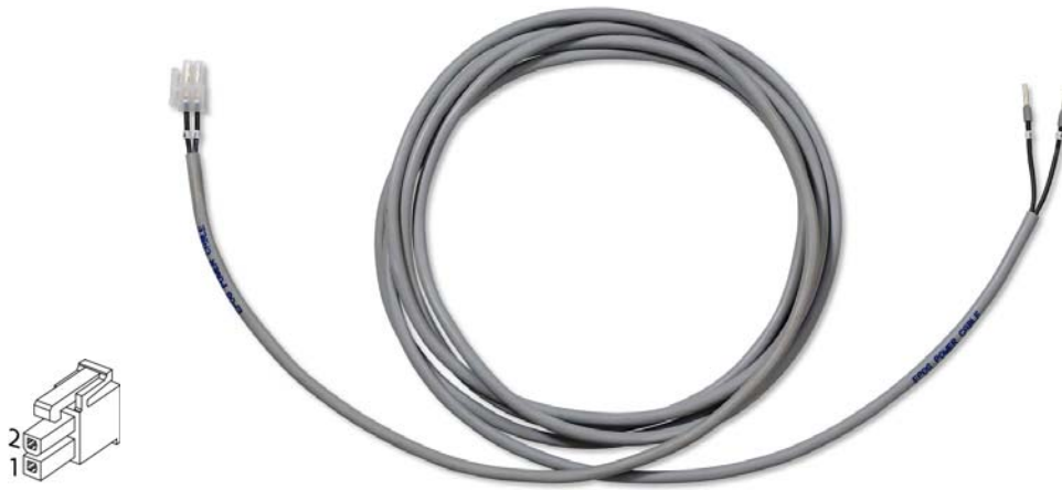
Figure 3-2 EPOS Power Cable