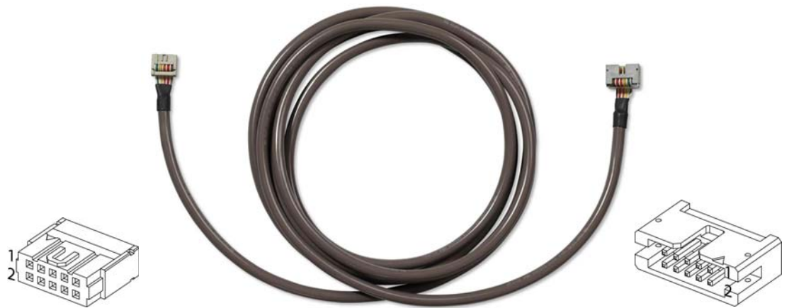
Figure 3-5 EPOS Encoder Cable