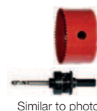
Similar to photo