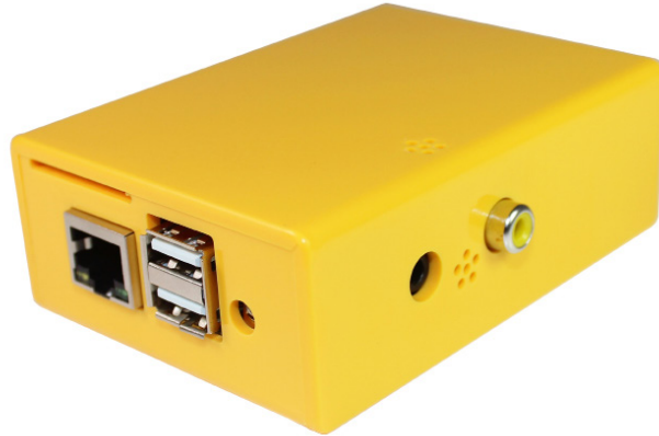
Banana Pi PCB not included