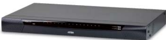
KN1116v front view