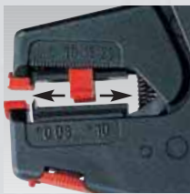
Adjustable length stop