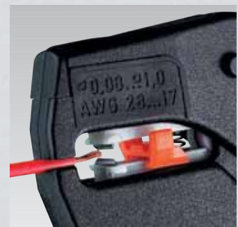
Adjusts automatically to the respective cable cross-section from 0.08 - 1.0 mm 2