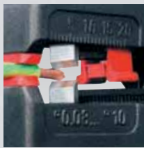
Precise stripping prevents damage to the conductor