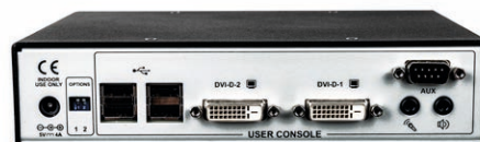
Avocent® HMX 6200R