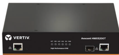
Avocent® HMX 5200T