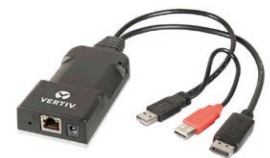
Avocent® HMX 6150T-DP

Vertiv.com | Vertiv Headquarters, 1050 Dearborn Drive, Columbus, OH, 43085, USA