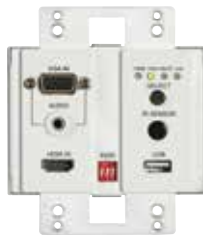
Wallplate Transmitter front panel.