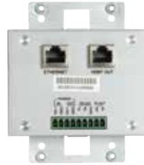
Wallplate Transmitter back panel.