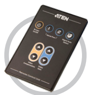
IR Remote Control Included