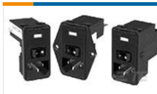
TE Part #6609106-6 PS0S0SH60=C1054