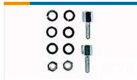
TE Part #5205817-3 FEMALE SCREWLOCK KIT