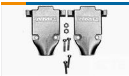
TE Part #5745174-4 CABLE CLAMP KIT,SZ 4,.425