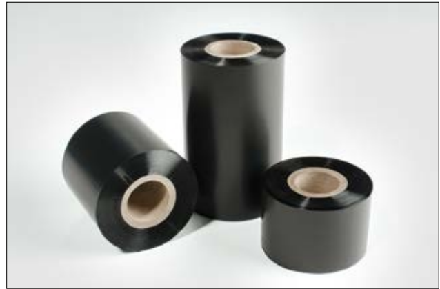
Ribbons for printing on tubes and Tiptags.