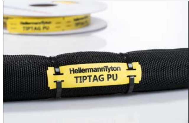
TIPTAG PU – The printed mark has a tattoo-like permanency.