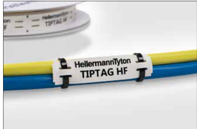
TIPTAG - High performance cable bundle marking.