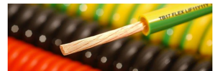
Photographs are for illustrative purposes only

Cable type : LiF11Y11Y 1x16,00 mm 2 TB17 FLEX Stranding : 903x0,15 mm bare copper wires Conductor insulation : PUR Conductor colours : transparent Overall sheath : PUR Colour : yellow/green Temperature range : -40 °C to +70 °C