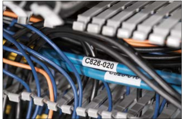
Helatag 1209 offers an excellent protection against abrasion and environmental impact.