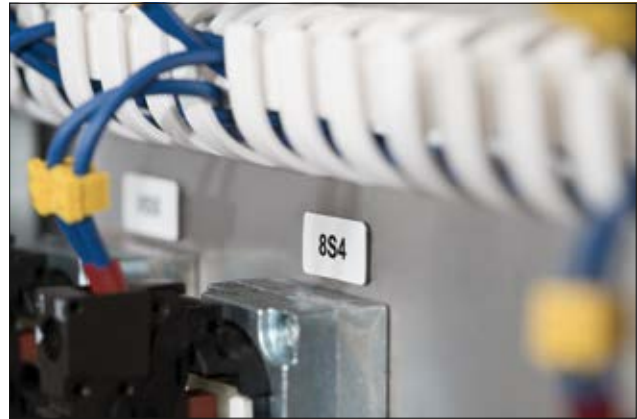
Panel labels Helatag 1220 – high performance adhesive ensures optimal adhesion to uneven surfaces.