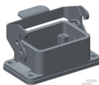
TE Part # T1500063000-000 H6B-AG