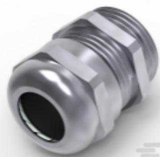
TE Part # T3609250102-000 DLX-25-M