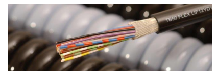
Photographs are for illustrative purposes only

Cable type : LiF12YD11Y 4x0,50 mm 2 TB50 FLEX Stranding : 64x0,10 mm bare copper wires Conductor insulation : TPE-E Conductor colours : according to DIN 47100 Shielding : by a lap of 0,10 mm tinned copper wires Overall sheath : PUR Colour : black (semi-glossy) Temperature range : -25 °C to +70 °C