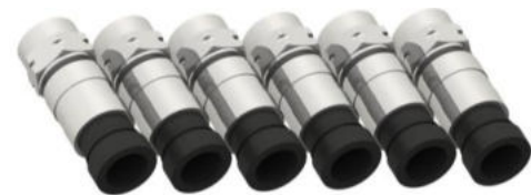
RG6 F Male Connectors