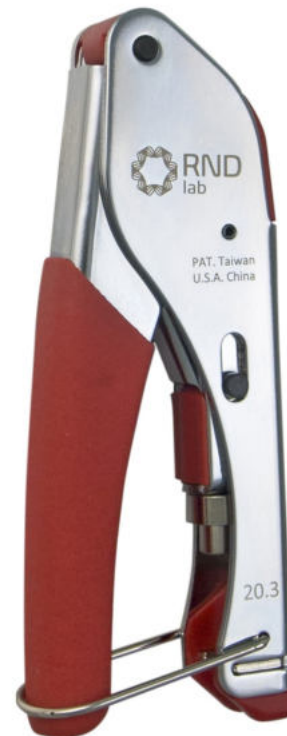
Fixed Compression Tool