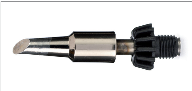
CX48 Professional 4.8 mm - Oblique Tip