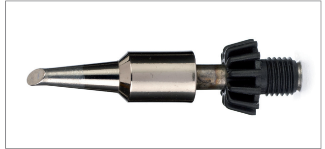
CX32 Professional 3.2 mm - Oblique Tip