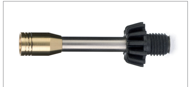
CX90 Professional Flame Tip