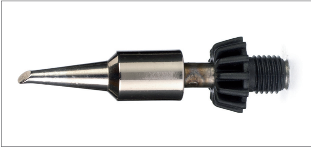
CX24 Professional 2.4 mm - Oblique Tip