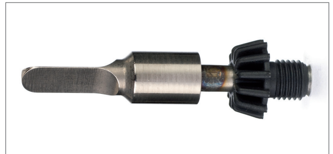
CX70 Professional Hot Knife Tip