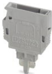
Component connector, Length: 24.2 mm, Width: 5.2 mm, Height: 33.3 mm, Number of positions: 1, Color: gray

Please be informed that the data shown in this PDF Document is generated from our Online Catalog. Please find the complete data in the user's documentation. Our General Terms of Use for Downloads are valid ( http://phoenixcontact.com/download )