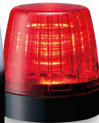
Mono-color Model (Red)