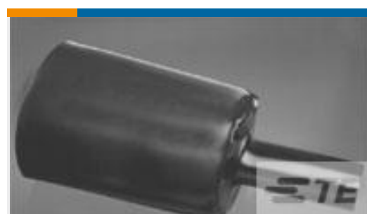
TE Part #CX7208-000 RHW-12/3-1200/ADH-0