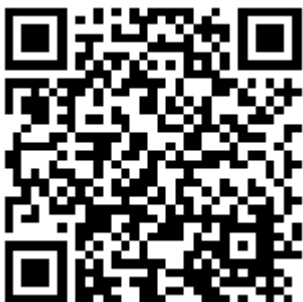
SCAN QR FOR PRODUCT PAGE

This part number has created a 3 metre duplex LC to SC OM3 LSZH patch cord in aqua.