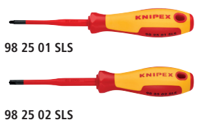
98 25 01 SLS