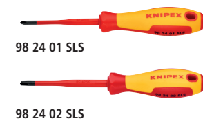
98 24 01 SLS

The through hole on the handle of all KNIPEX screwdrivers permits connection to our tool securing system, illustrated here by way of example on the handle of our new KNIPEX "Slim" screwdriver for PlusMinus profile screws.