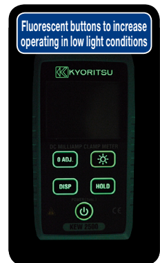
Fluorescent buttons to increase operating in low light conditions