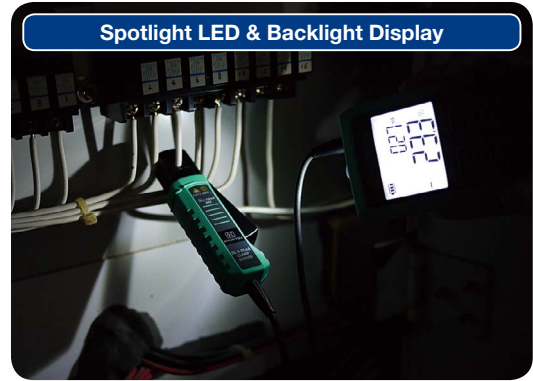
Spotlight LED & Backlight Display