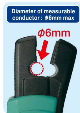
Diameter of measurable conductor : φ6mm max