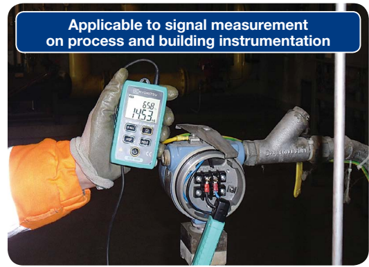
Applicable to signal measurement on process and building instrumentation