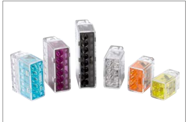
Connectors of the HelaCon Plus family offering multiple sizes and colours.