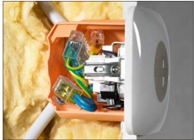
A huge variety of connectors from 2 to 8 poles is available according to the application. The transparent housings allow a quick and easy checking of the conductor fitting.