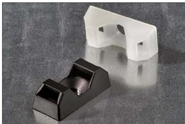
Q-Mount, CTQM 2-way entry, screwable.