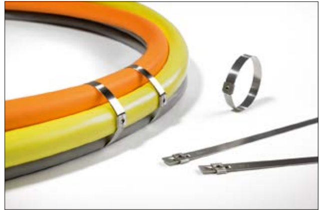
Stainless Steel Cable Ties MST-Series.