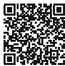
One Step to the Web!

The MST-Series (up to 8.9 mm) can be used in combination with the stainless steel P-Mount. The mount is simple to install with a screw or bolt and ensures a durable fixing solution. Please see page 143.