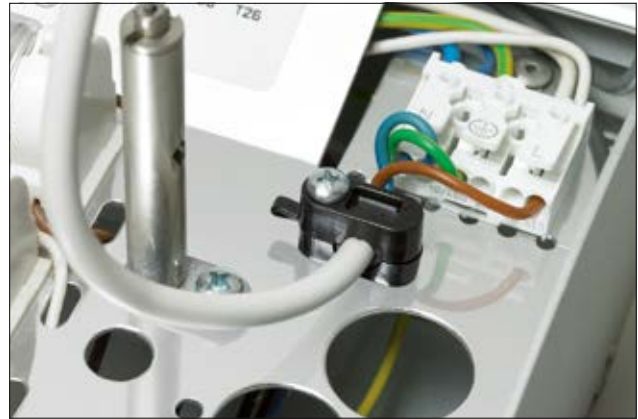
Strain relief Klam-Klip in application.