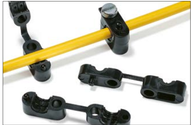
Klam-Klips KK1 - 4.