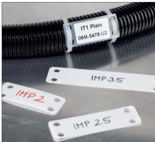
Unlimited cable bundle diameters can be securely identified.