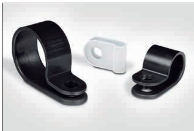
P-Clamps H1P - H18P in different dimensions.