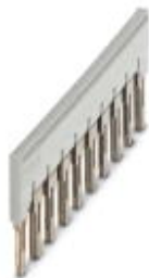
Plug-in bridge, Pitch: 8.2 mm, Number of positions: 10, Color: gray

Please be informed that the data shown in this PDF Document is generated from our Online Catalog. Please find the complete data in the user's documentation. Our General Terms of Use for Downloads are valid ( http://phoenixcontact.com/download )