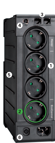
Eaton Ellipse PRO 650