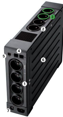
Eaton Ellipse PRO 1600