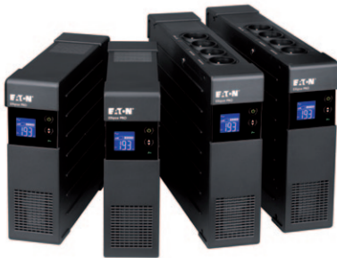
Ellipse Pro range