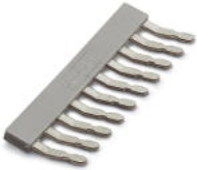
Insertion bridge, Pitch: 5.2 mm, Number of positions: 10, Color: gray

Please be informed that the data shown in this PDF Document is generated from our Online Catalog. Please find the complete data in the user's documentation. Our General Terms of Use for Downloads are valid ( http://phoenixcontact.com/download )