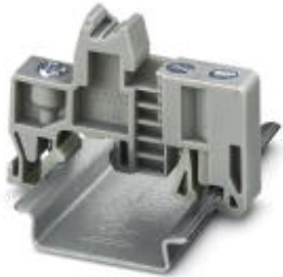
End clamp, Width: 9.5 mm, Height: 35.3 mm, Length: 50.5 mm, Color: gray

Please be informed that the data shown in this PDF Document is generated from our Online Catalog. Please find the complete data in the user's documentation. Our General Terms of Use for Downloads are valid ( http://phoenixcontact.com/download )