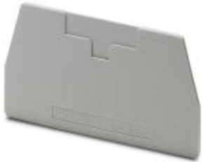
End cover, Length: 72 mm, Width: 2.2 mm, Height: 41.5 mm, Color: gray

Please be informed that the data shown in this PDF Document is generated from our Online Catalog. Please find the complete data in the user's documentation. Our General Terms of Use for Downloads are valid ( http://phoenixcontact.com/download )