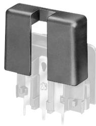
E.g. Rear cover for GSF1