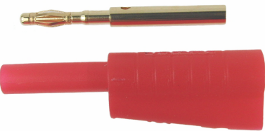
FCR7366R P18S 2mm PLUG SHROUDED RED