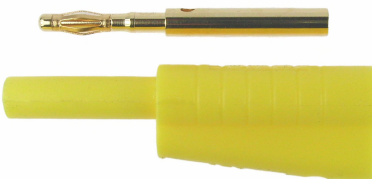
FCR7366Y P18S 2mm PLUG SHROUDED YELLOW