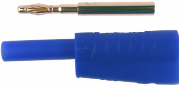
FCR7366L P18S 2mm PLUG SHROUDED BLUE