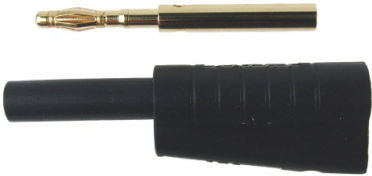
FCR7366B P18S 2mm PLUG SHROUDED BLACK