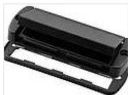
Mounting lid with hinged aluminium flap