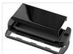
Mounting lid with infrared-permissive plastic cap