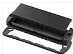
Mounting lid with removable aluminium cap