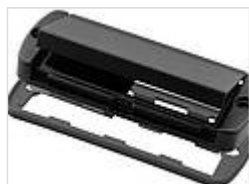
Mounting lid with hinged aluminium flap and compartment for 9V block battery