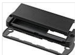
Mounting lid with removable aluminium cap and compartment for 9V block battery