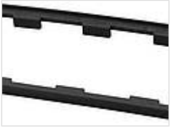
Seals UL 94 V0