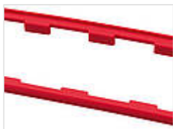
Seals, fire red