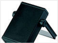
Handle / Tip-up bow, hinged