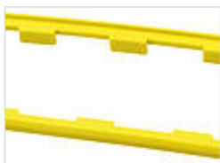
Seals, rape yellow