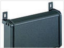
Wall brackets, sheet steel