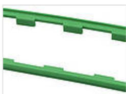
Seals, patina green