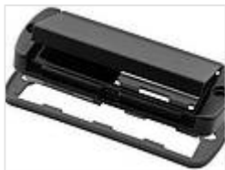
Mounting lid with hinged aluminium flap and compartment for 9V block battery