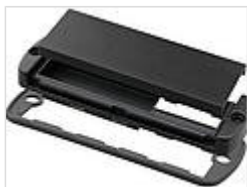
Mounting lid with removable aluminium cap and compartment for 9V block battery