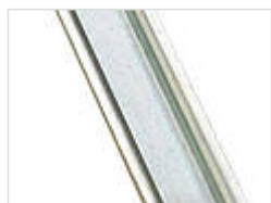
DIN rails DIN EN 60715 TH 15, galvanised steel

For A 114, A 116, A 118, P 305-322, P 324-329