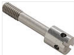
Capstan-headed screws, sealable