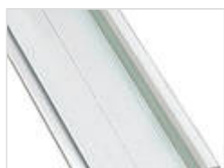
DIN rails DIN EN 60715 TH 35, galvanised steel