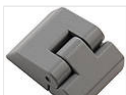
Set of hinges