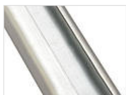
DIN rails DIN EN 60715 G 32, galvanised steel