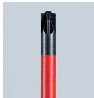
98 25 02 SLS: Pozidriv®/slotted