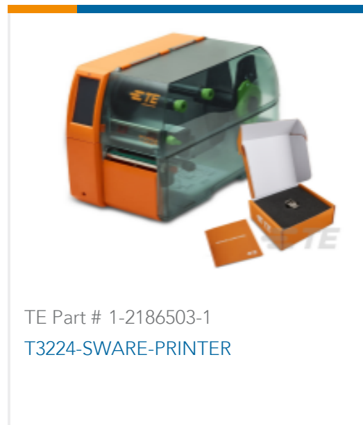
TE Part # 1-2186503-1 T3224-SWARE-PRINTER