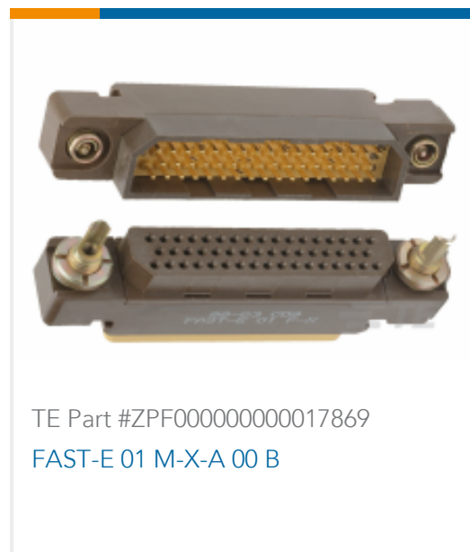
TE Part #ZPF00000000017869 FAST-E 01 M-X-A 00 B