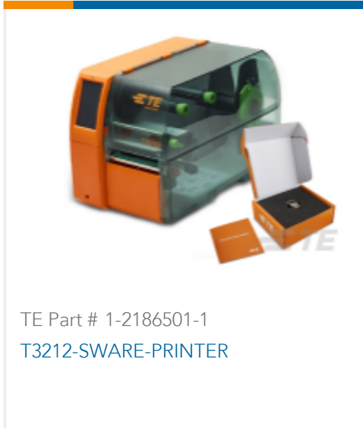
TE Part # 1-2186501-1 T3212-SWARE-PRINTER