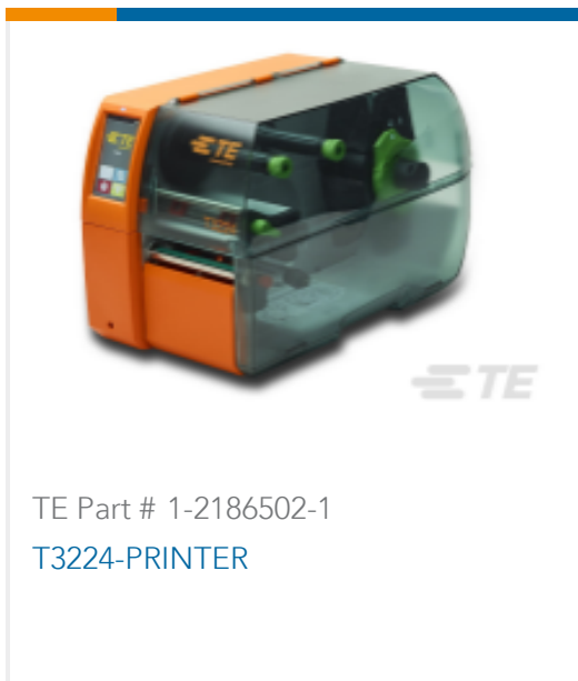
TE Part # 1-2186502-1 T3224-PRINTER