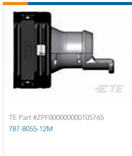
TE Part #ZPF000000000105765 787-8055-12M