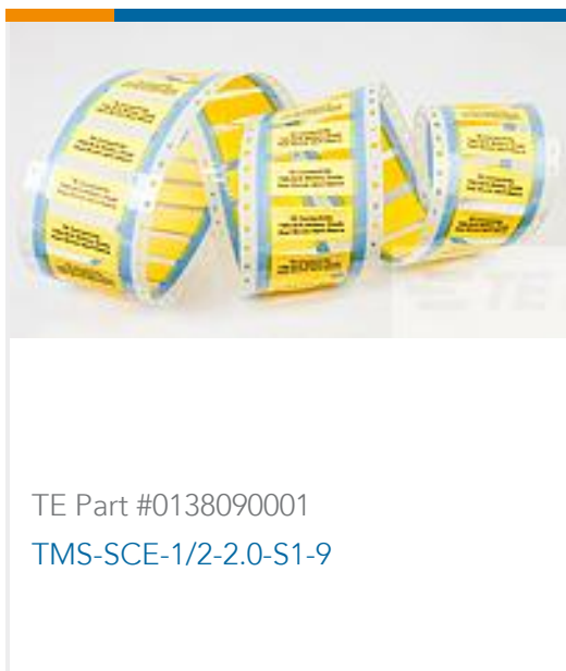
TE Part #0138090001 TMS-SCE-1/2-2.0-S1-9