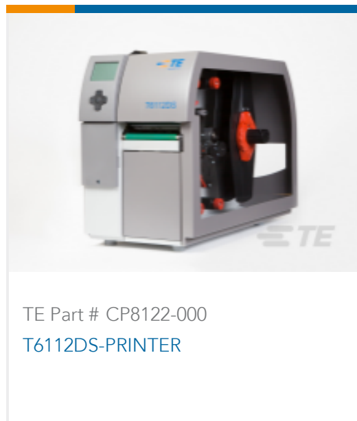
TE Part # CP8122-000 T6112DS-PRINTER