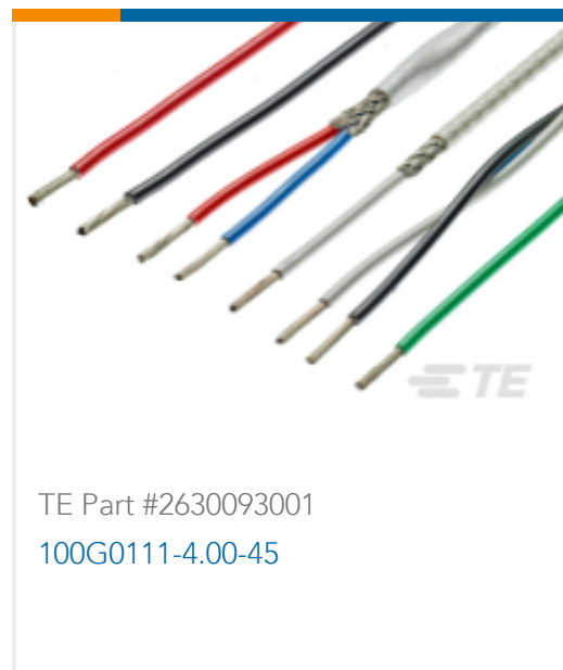
TE Part #2630093001 100G0111-4.00-45