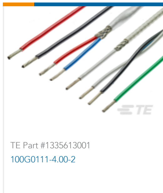
TE Part #1335613001 100G0111-4.00-2