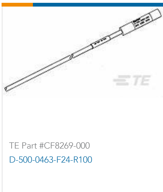
TE Part #CF8269-000 D-500-0463-F24-R100