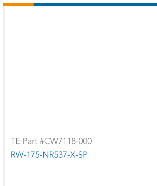
TE Part #CW7118-000 RW-175-NR537-X-SP