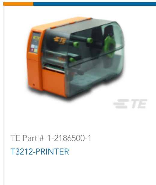
TE Part # 1-2186500-1 T3212-PRINTER