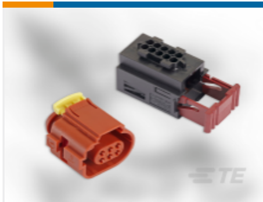
TE Part #929504-2 TIMER, CONNECTOR HOUSING