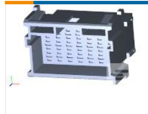
TE Part #2-967630-1 FLA-STE-GEH2, 8MM21P