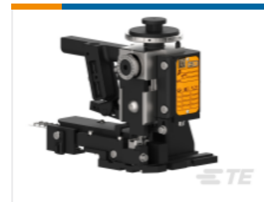
TE Part # 2151379-1 OCEAN_2.0_Applicator-S-080F1100V