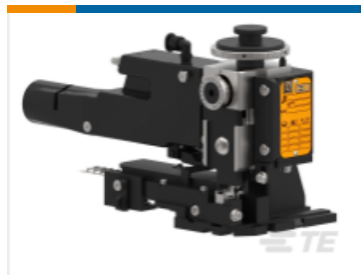
TE Part # 2151379-2 OCEAN_2.0_Applicator-S-080F1100V