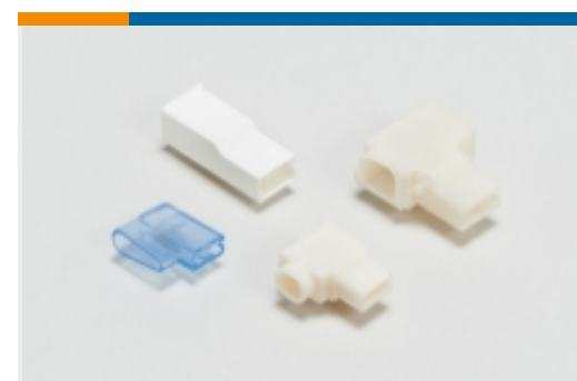
Crimp Terminal Housings(34)