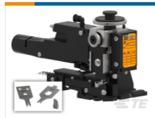
TE Part # 7-2151379-2 OCEAN_2.0_Applicator-S-080F1100V