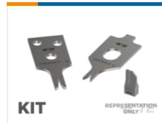
TE Part # 7-2151379-7 OCEAN_2.0_SPARE_PART_KIT-080F1100V