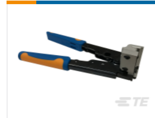
TE Part # 2305570-1 TERMINAL CUTTER, SIDE FEED