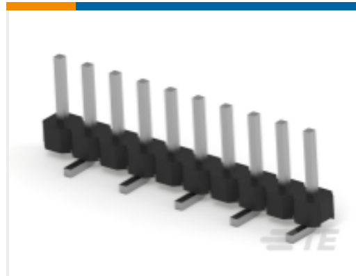
TE Part #1-2842102-0 10P, 2MM, BRK HDR, SRVT, SMD, 0.1AU, TR W/CAP