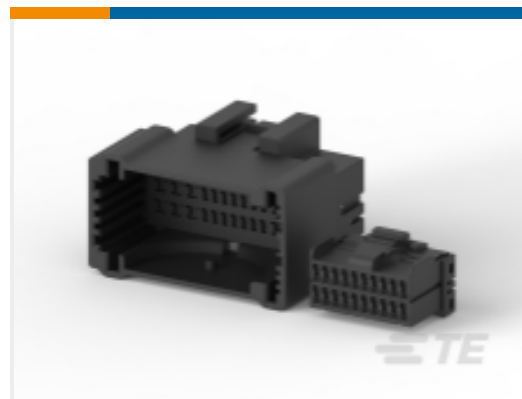
TE Part # CAT-M9194-CH8172 MULTILOCK, CONNECTOR HOUSING