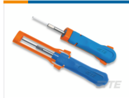
TE Part # 1-1579007-4 EXTRACTION TOOL