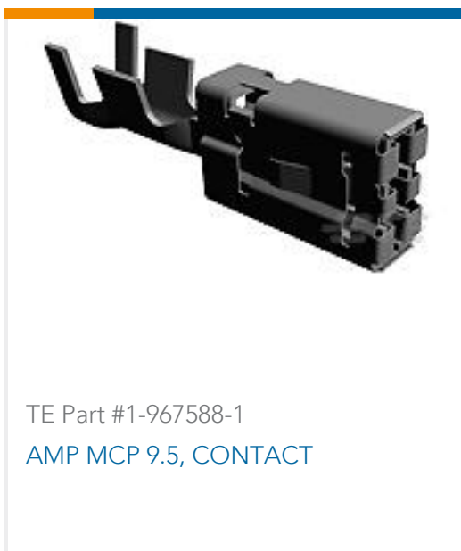
TE Part #1-967588-1 AMP MCP 9.5, CONTACT