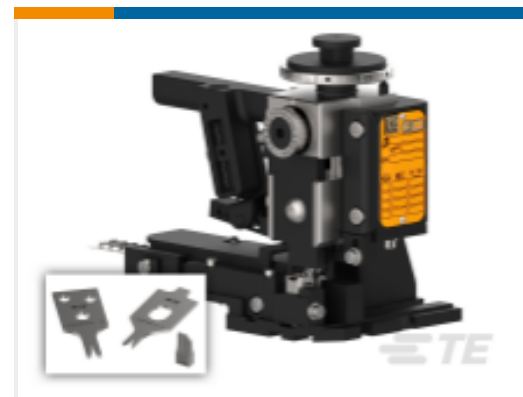
TE Part # 7-2151379-1 OCEAN_2.0_Applicator-S-080F1100V