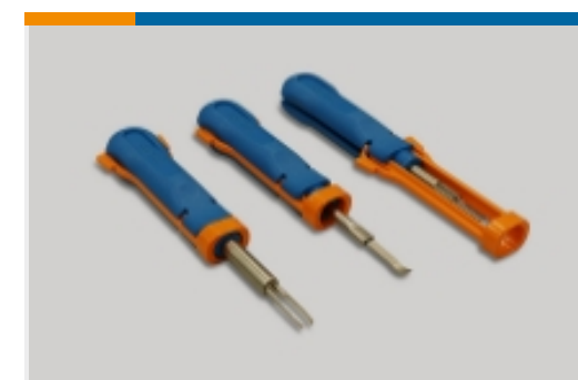
Insertion & Extraction Tools(3)