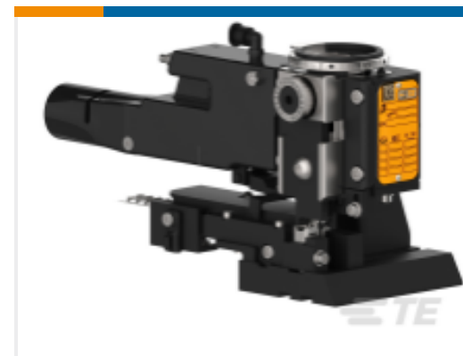
TE Part # 2-2151379-2 OCEAN_2.0_Applicator-S-080F1100V