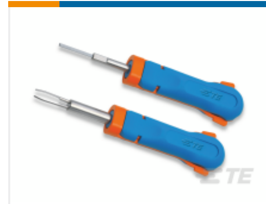
TE Part # 4-1579007-3 EXTRACTION TOOL KIT