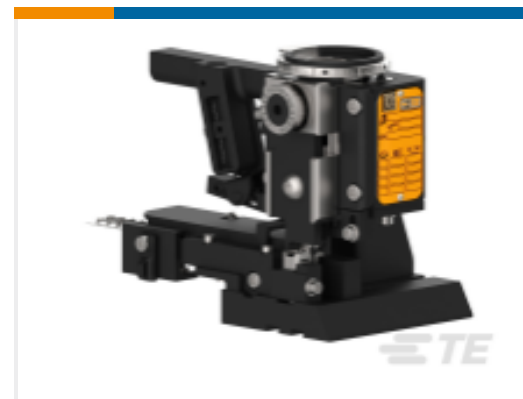
TE Part # 2-2151379-1 OCEAN_2.0_Applicator-S-080F1100V